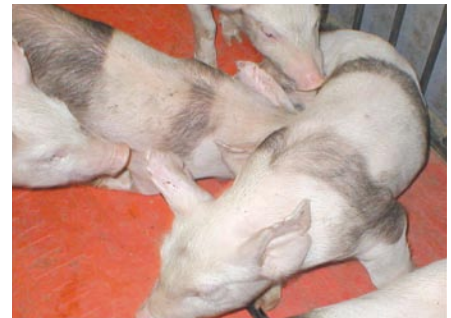
This piglet at the centre is bellynosing – this raises welfare concerns

Studies have shown that 4-5% of recipient piglets in commercial herds have severe redness or irritation on their bellies, with up to 88% having some form of lesion.