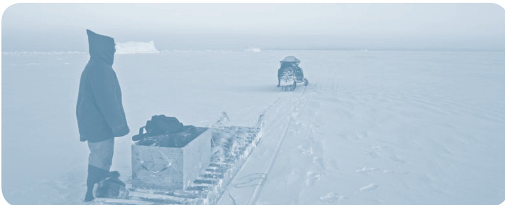
Hunters are taking along more safety gear in case the weather suddenly changes or they get into difficulties

Changes in the physical environment are being managed in conjunction with opportunities and challenges posed by changes in social, cultural, technological, and economic conditions. On the one hand, new opportunities have emerged. VHF radios enable safer travel; if difficulties are encountered help can be summoned. And the diversification of food production away from a total reliance on country food has reduced vulnerability to changes in resource availability and accessibility. Overall, however, societal changes are straining the mechanisms through which Inuit manage climatic and environmental conditions. There are emerging vulnerabilities among younger generations due to erosion of land-based knowledge and skills necessary for safe hunting, a weakening of sharing networks in the community, increasing dependence on technology, and reliance on outside financial support.