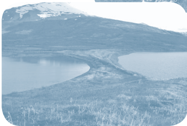
View west, Portage Bay, Alaska Peninsula Pacific coast. The prehistoric and historic winter village of Kanataq is situated on the beach ridges south of Kanataq Lake (NSF Project OPP-0102687).

these four beach ridges beginning at least 1,900 years ago based on radiocarbon dating of burned wood associated with human activities. The winter village of Kanataq was inhabited from that time until recent historic times. According to historic accounts of former residents, the villagers experienced earthquakes and tsunamis, but appear to have been little affected by the volcanic activity on the Peninsula. Only small traces of volcanic ash, possibly from the Aniakchak volcanic explosions around 4,000 and 3,000 years ago, were identified at Kanataq.