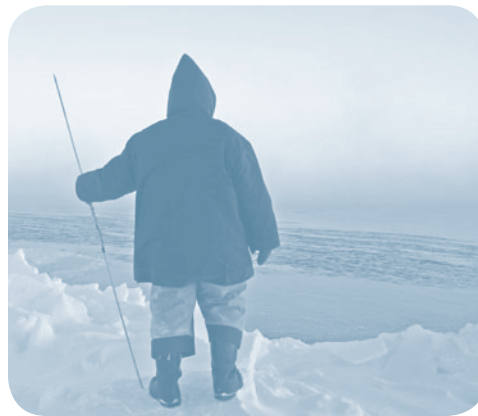
Hunting at the floe edge is becoming increasingly dangerous with unpredictable weather and wind

• Strong social networks. The sharing of traditional food underpins food security as changing environmental conditions make certain hunting areas inaccessible to those who lack the equipment, knowledge, or time. Social networks also provide mechanisms for the rapid and effective community dissemination of information on dangerous conditions and the pooling of risk.