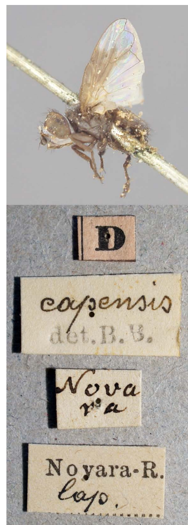
Figure 5. Alophora capensis Schiner.

Alophora capensis Schiner, 1868 [currently Phasia nasuta (Loew)] (Fig. 5). Schiner (1868: 337) described this species from “Ein Männchen vom Cap der guten Hoffnung” [“One male from Cape of Good Hope”]. The work of Schiner (1868) dealt with specimens collected during the voyage of the frigate Novara , 1857–1859. Although the specimen in Fig. 5 does not bear a type label (which in similar cases was