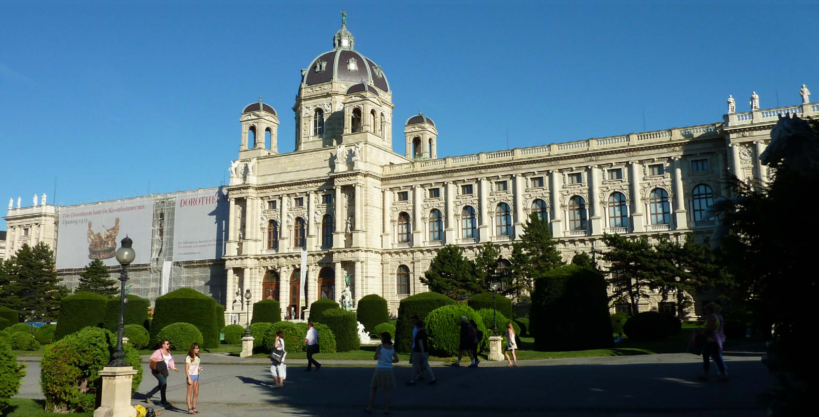
Figure 1. Naturhistorisches Museum, Vienna