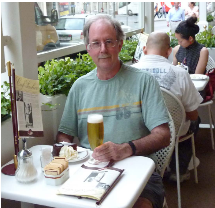
Figure 9. The author enjoys a Sacher-Torte and glass of Austrian beer at Hotel Sacher after a day at the Museum.