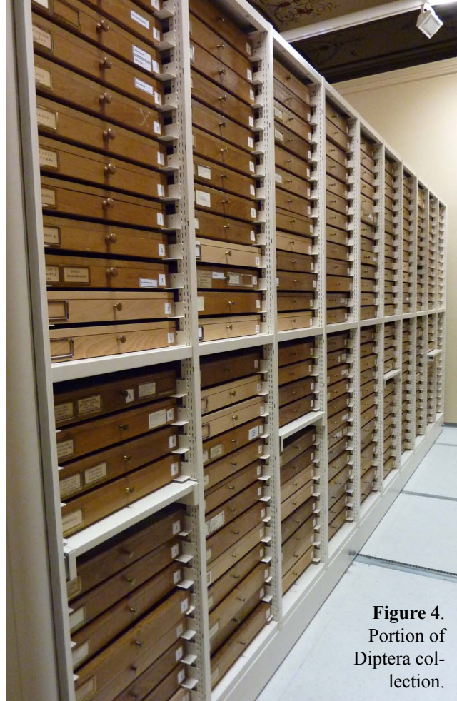
Figure 4. Portion of Diptera collection.

French medical doctor Joseph Villeneuve (b.1868–d.1944) also has tachinid types in NHMW. Villeneuve was a prolific amateur dipterist who described close to 500 nominal species of Tachinidae (most still valid today) over a span of 45 years. He published a couple of influential papers on relationships among Oestroidea (Villeneuve 1924, 1933), but most of his papers were short and consisted of isolated species descriptions. He rarely published keys and even in an age when holotypes were routinely designated, he was lax in the recording of type data and depositories. Villeneuve's types are spread among many museums throughout the world. He visited NHMW at least once (Mesnil 1950) and very likely borrowed material and worked on it at his home in Rambouillet, France.