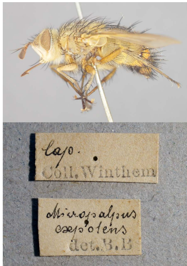
Figure 7. Tachinomima expetens Brauer & Bergenstamm.

Tachinomima expetens Brauer & Bergenstamm, 1891 [currently Linnaemya longirostris (Macquart)] (Fig. 7). This species was described by Brauer & Bergenstamm (1891: 79) from at least one male and one female from “Cap. b. sp.” (“Cap Bonae Spei” = Cape of Good Hope, SA). This male from “Cap.” appears to be an original syntype. There is also one female in NHMW that appears to be an original syntype. They are both from “Coll. Winthem”, meaning they belonged to the Winthem Collection that was purchased in 1852. Townsend (1939: 215) cited a “Ht male” from Cape of Good Hope in NHMW and I regard this statement as a lectotype fixation for the male specimen shown here.