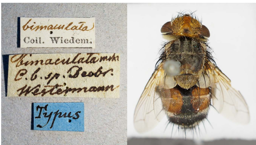
Figure 6. Gonia bimaculata Wiedemann.

Gonia bimaculata Wiedemann, 1819 [currently valid] (Fig. 6). Wiedemann (1819: 25) described this species from an unspecified number of females from “Prom. bon sp. Decbr.” (Latin for “Promontorium Bonae Spei [= Cape of Good Hope, SA], December”). Bernt W. Westermann collected at Cape of Good Hope prior to 1817. Most of the Westermann material studied by Wiedemann is in the Natural History Museum of Denmark in Copenhagen but this specimen must have stayed in the Wiedemann collection (which was purchased by Winthem, whose collection in turn was purchased by NHMW, as explained above). The “Typus” label is written in Villeneuve’s hand on his distinctive blue paper and thus was added much later. The specimen is properly regarded as a syntype because there is a possibility that other type specimens exist.