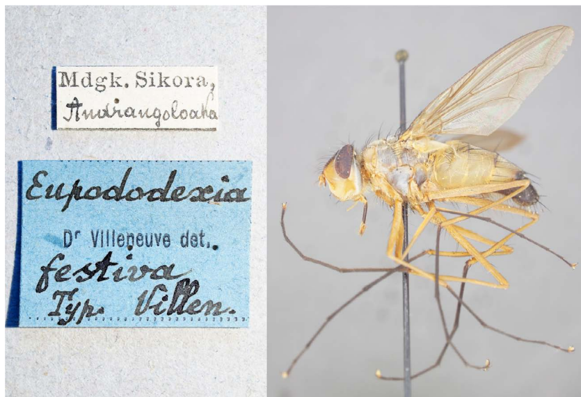
Figure 8. Eupododexia festiva Villeeneuve.

Eupododexia festiva Villeneuve, 1915 [currently valid] (Fig. 8). Villeeneuve (1915: 201) described this species from two males collected by Sikora from Andrangoloaka (Madagascar). The single male in NHMW bears Villeeneuve's blue label with neatly handwritten data. Villeeneuve would frequently label some but not all syntypes as "Typ."; he did not use "Typ." in the same sense as a holotype (or at least not consistently). Townsend (1938: 335) cited a "Ht male" from Andrangoloaka in NHMW and I regard this statement as a lectotype fixation for the male specimen in Fig. 8. The other male in the type series is in the Canadian National Collection of Insects in Ottawa.