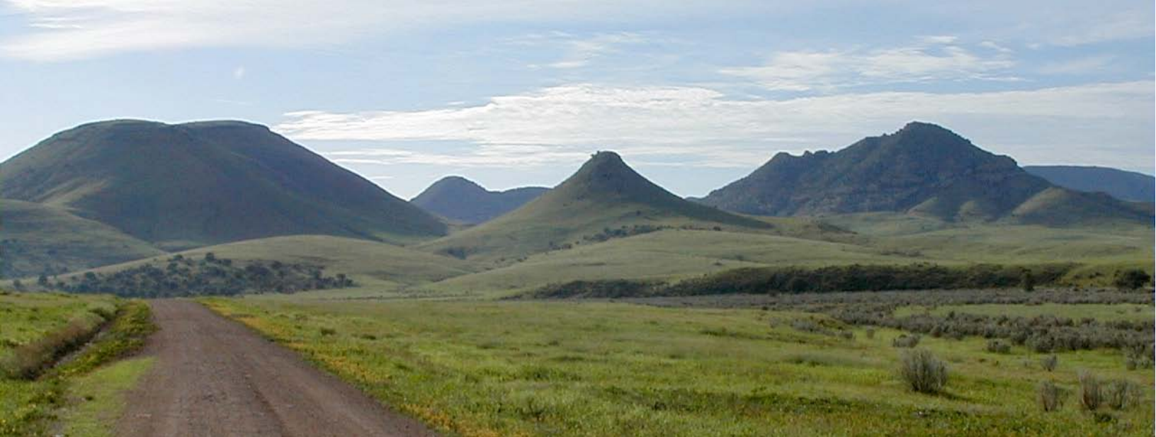
Figure 4. Unexplored hilltops near the Winchester Mountains in southern Arizona, USA.