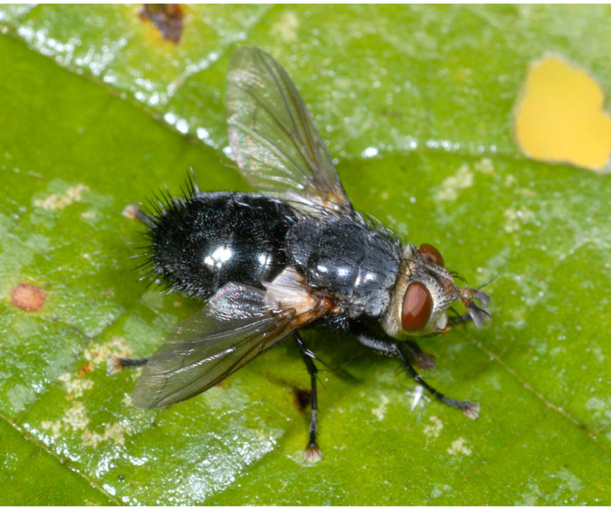
Figure 2. An Archytas sp. sitting on a leaf in Tar Hollow State Park, Ohio (USA).

“on the side” while conducting other work. We were not in a big rush to get rejected yet again, so we put off re-submitting a revamped proposal until 2010, when we invited Jim O’Hara (CNC) to be a collaborator. In this revised proposal, we sought to make the tachinid phylogeny project more of a collaborative effort as you can see from my 2010 article in The Tachinid Times exhorting aid from tachinid workers. This same year, Tachi and Shima (2010) published their paper focused on the phylogeny of Exoristinae, a vast improvement over my initial attempts. This paper demonstrated the potential insight that phylogenetic analysis of tachinids could provide, and spurred our efforts. Again, our proposal was rejected. But we were not so easily deterred; we revised it and resubmitted it twice more, each time expanding our goals and proposed products.