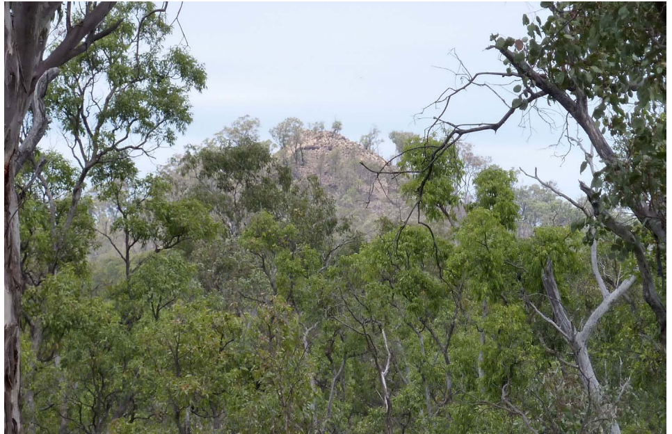
Figure 16. The summit of Fly Hill in the Mt. Moffatt Section of Carnarvon National Park is barely 100 metres above the surrounding forest but is a mecca for hilltopping tachinids (and tachinidologists).

The second day was supposed to be an ascent of the more formidable Mt. Moffatt, but a completely overcast sky and periodic light rain forced a change in plans. We visited The Tombs area instead and hiked the loop trail, nets in hand, but caught little. That evening we drove to a place where a small stream crosses the road and tried blacklighting, but again with little success.