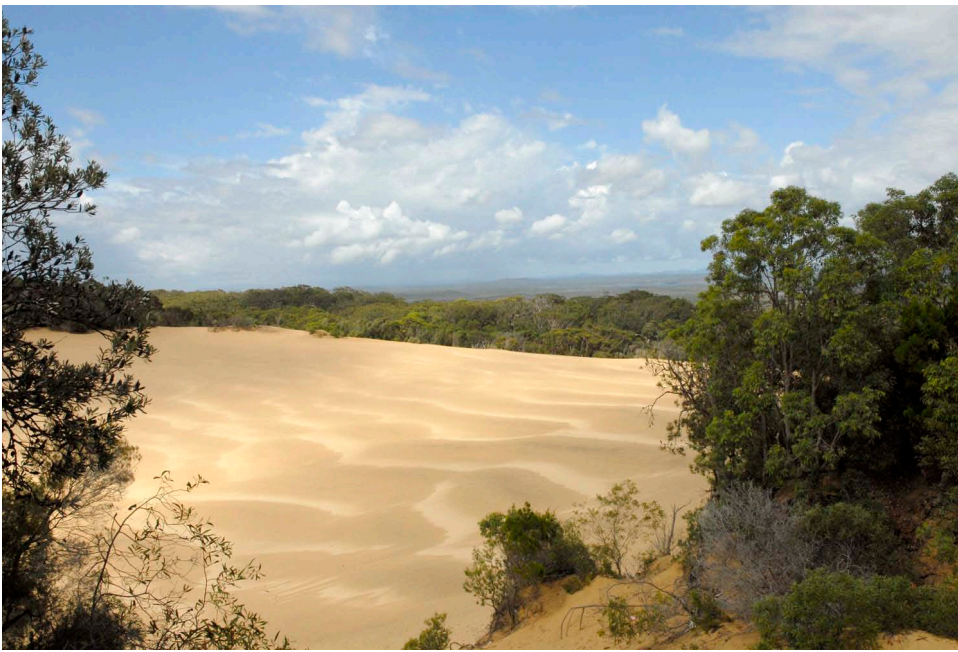
Figure 20. View of Carlo Sandblow in the aptly named Great Sandy National Park.