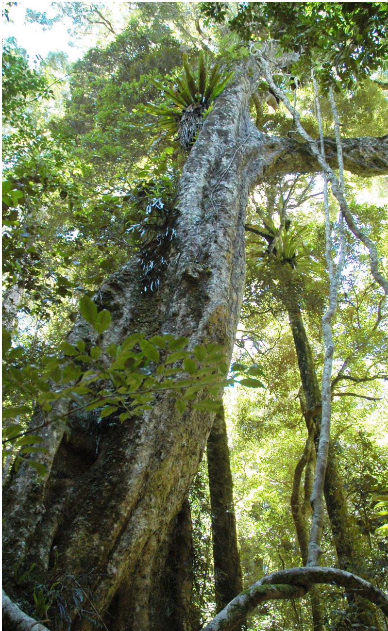
Figure 1. Epiphyte-laden tree in the lush rainforest of Lamington National Park, Queensland.