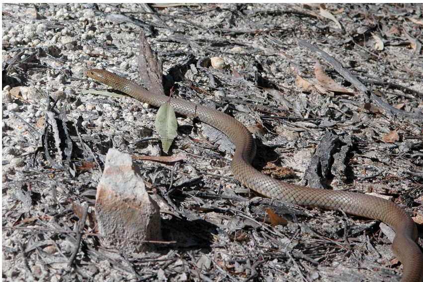
Figure 19. An eastern brown snake ( Pseudonaja textilis ) slithers to safety after being disturbed on the dirt road to the Consuelo Tableland in Carnarvon National Park. This is ranked as the world's second most venomous snake in some listings and is responsible for more snakebite deaths in Australia than any other snake.

After leaving Mt. Tinbeerwah, we traveled slightly inland to try collecting in Conondale National Park, a moderate-sized (35,500 ha) mountain park encompassing the Conondale Mountain Range, somewhat similar