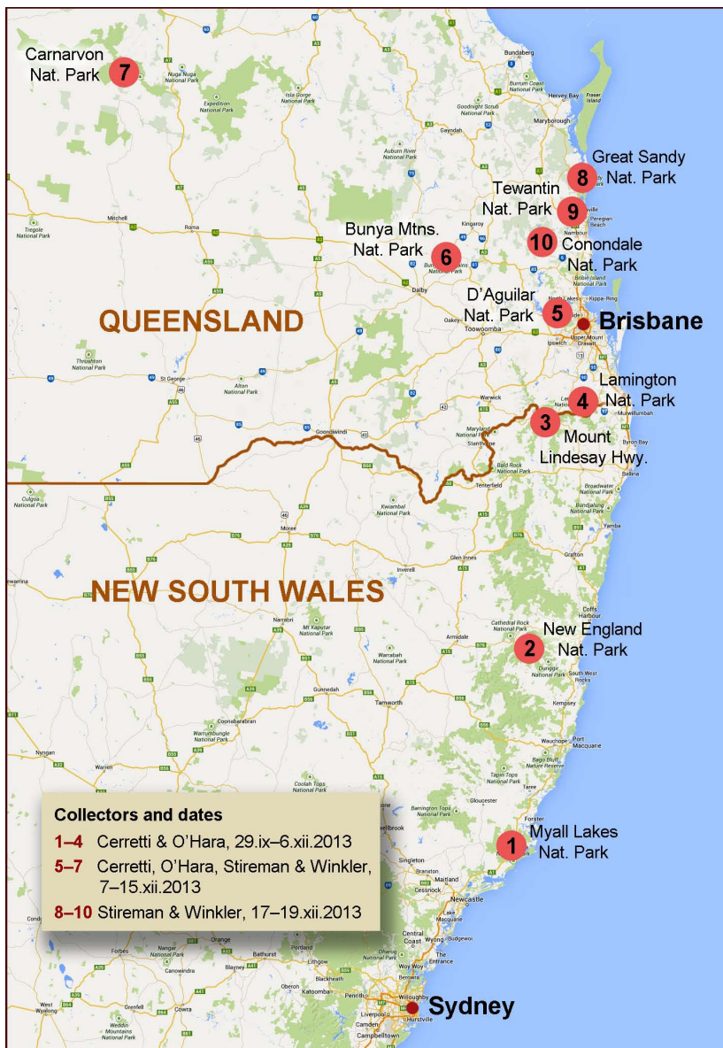
Figure 3. Map of major stops along our route during our collecting trip to eastern Australia.

Upon arriving at Point Lookout we were greeted by an intense buzzing coming from the bushes alongside the parking lot. To our disappointment, however, we quickly realized that much of the buzzing was produced by flies of the genus Calliphora Robineau-Desvoidy (Calliphoridae) (Fig. 4). Interestingly, among the thousands of Calliphora we managed to collect some interesting Tachinidae that were impressive in their resemblance to calliphorids in shape and colour and also mimicked the posture of the wings at rest, held along the body rather than slightly apart as is the rule for most tachinids. A pretty smaller-sized Rutilia (subgenus Microrutilia Townsend) with dark metallic reflections was one of the most abundant tachinid species at Point Lookout (Fig. 5). Along the path leading between overlooks we caught a few long-legged dexiines of the genus Senostoma Macquart on tree trunks (Fig. 6).