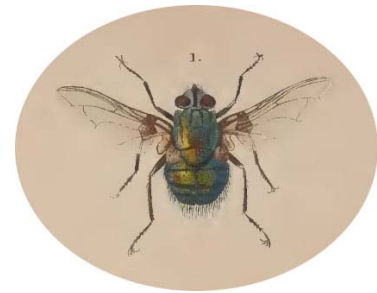
Figure 2. Rutilia regalis Guérin-Méneville, one of the first tachinids described from Australia (from Guérin-Méneville 1831: pl. 21).