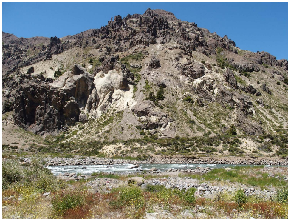
Figure 16. Lower elevation collecting site along the Río Maule.