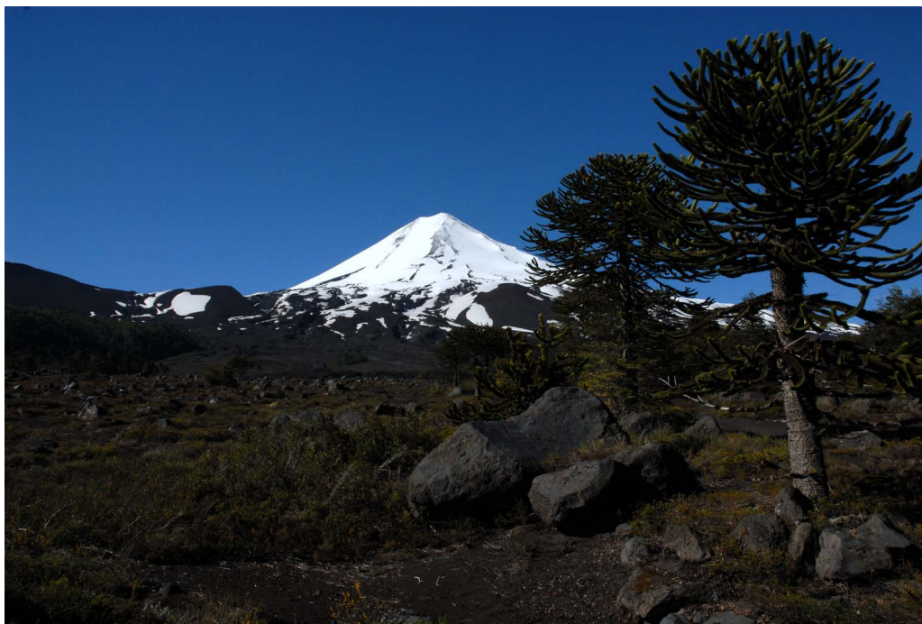
Figure 24. Snow covered volcán Llaima in Parque Nacional Conguillío.

Siphonini: Siphona (Siphona) sp. [1 male]