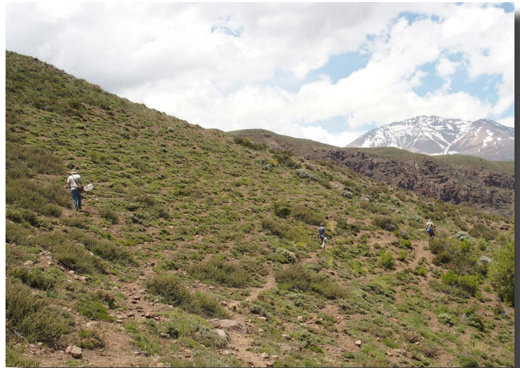
Figure 4. Dry scrubland covers the mountains on the road to the Lagunillas ski area, Valle de Maipo (east of Santiago) (Dec. 8).