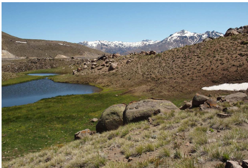
Figure 15. Scenic but cool highlands close to Laguna del Maule. No tachinids here.

Siphonini: Siphona ( Siphona ) sp. [1female]