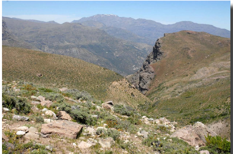
Figure 11. Low shrubs and grasses along Valle Nevado road, where we collected from Euphorbia flowers.

Graphogastrini: Campsodes (cf. Phytomyptera Rondani) sp. [1 male]