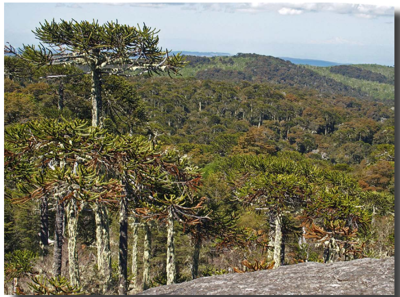
Figure 18. View of the picturesque Aracauria forest from atop Piedra del Águila.