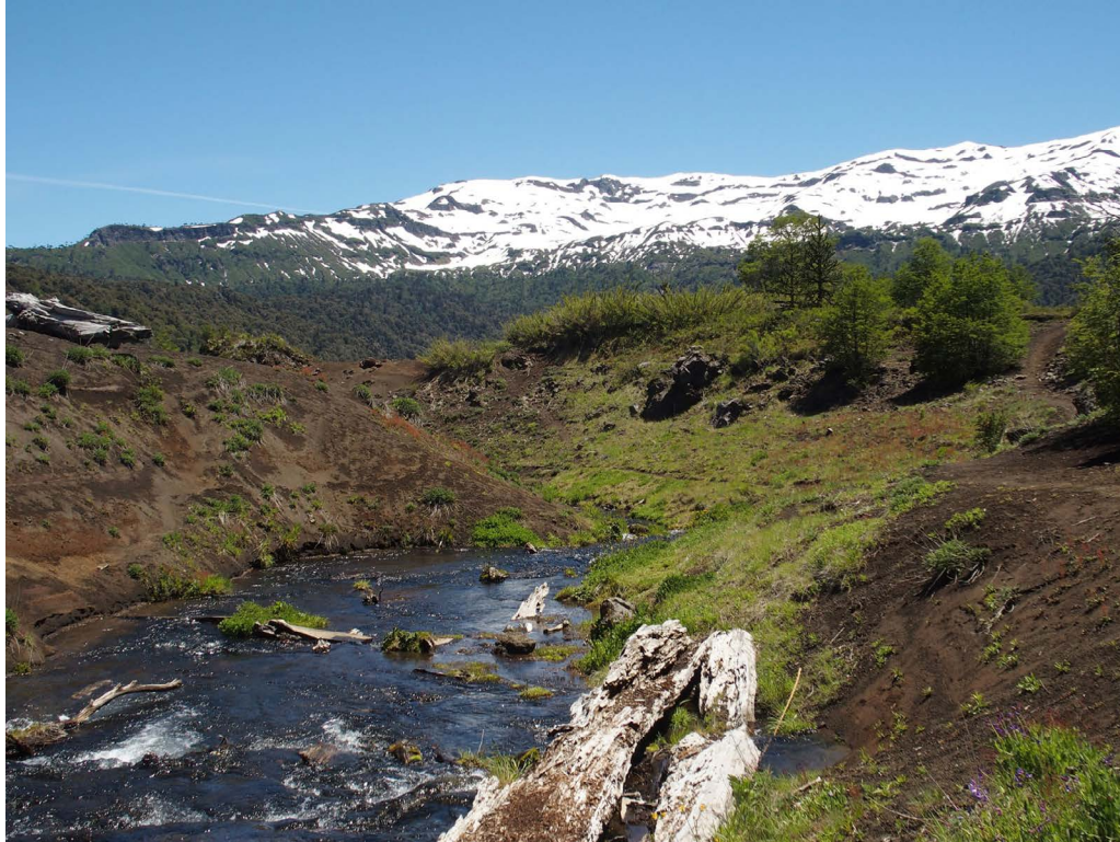
Figure 26. There was relatively good collecting here close to Laguna Conguillío.