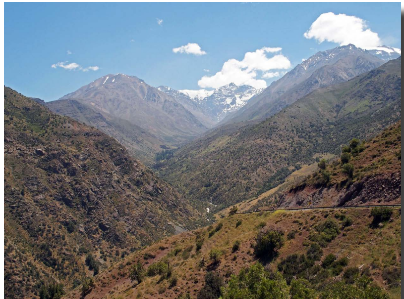
Figure 9. View eastward into the high Andes from a popular stop along the road, Mirador de Los Tres Valles.

Tachinini: Archytas cf. scutellatus (Macquart) [4 females]