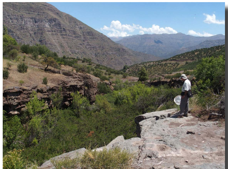
Figure 6. Jim is hoping for a tachinid here at Estero el Saucé, near San Jose del Maipo (east of Santiago). This was a poor collecting site.