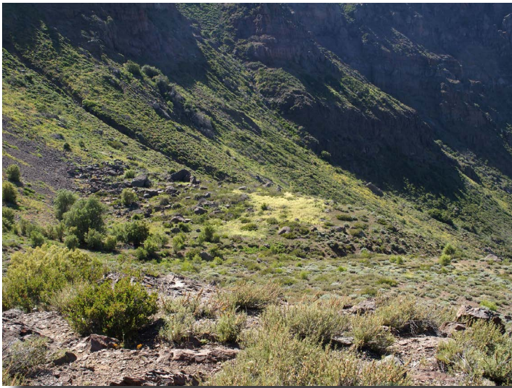
Figure 5. A slightly more lush area was discovered just over the hill from the place shown in Fig. 4. The yellow spot in the center was relatively good for tachinids on Dec. 8 but not on Dec. 19.