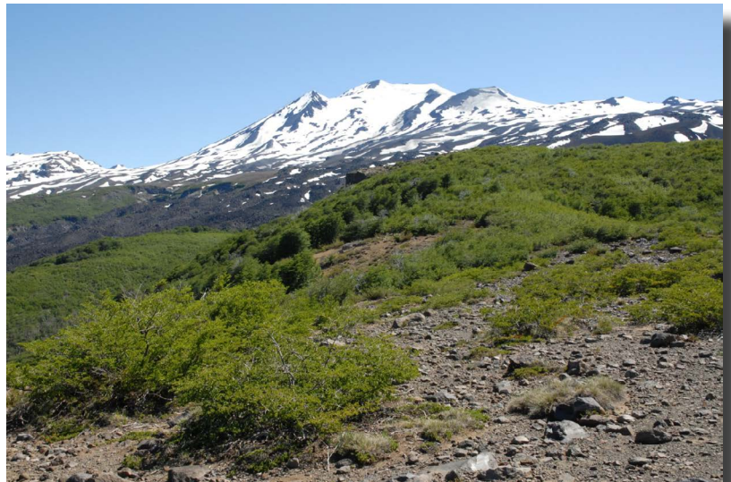
Figure 14. A windy ridge above Valle Las Trancas, looking towards Nevados de Chillán.