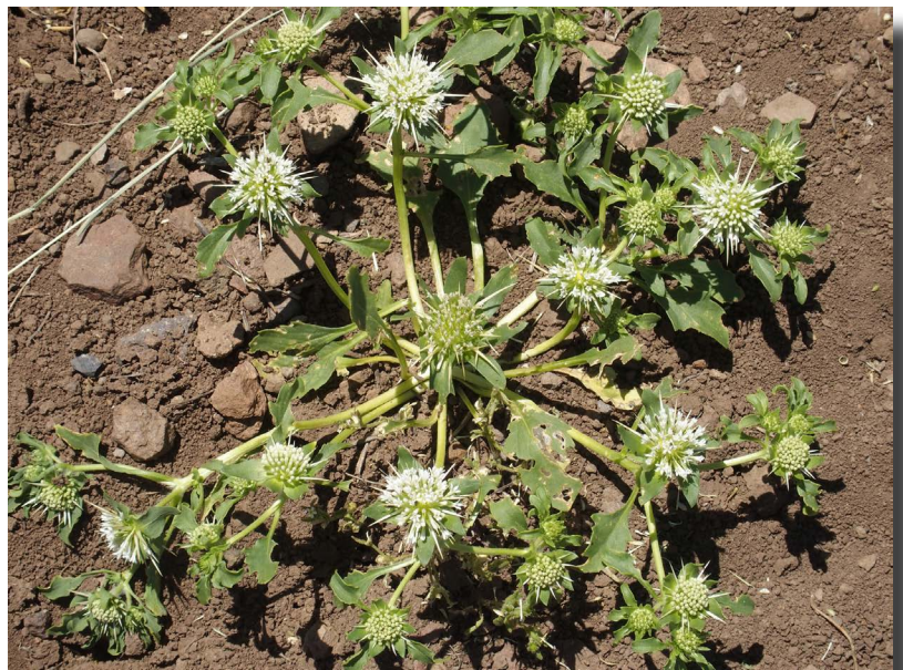
Figure 8. Close-up of one of the plants in Fig. 7 that tachinids found highly attractive.