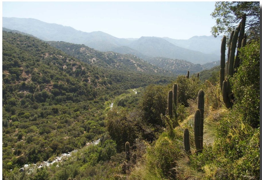
Figure 12. The Reserva Nacional Río Clarillo southeast of Santiago.

Siphonini: Siphona ( Pseudosiphona ) sp. [1 male]