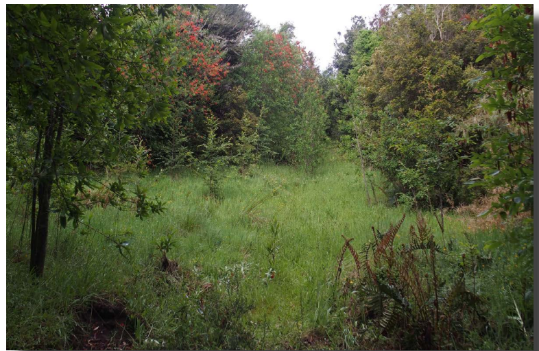
Figure 28. This sheltered grassy meadow in Parque Nacional Puyehue was a great spot for tachinids and especially Peleteria .