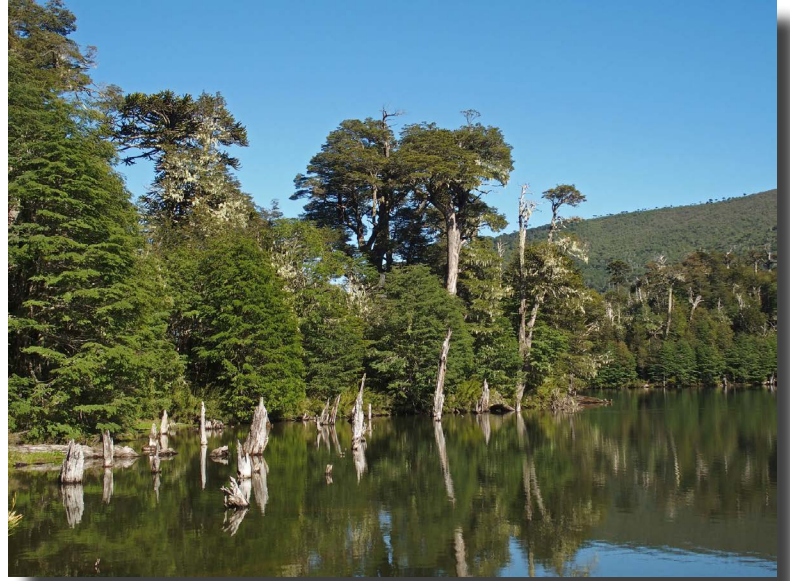
Figure 25. Laguna Captrén near entrance to Parque Nacional Conguillío.

Tachinini: Deopalpus australis (Townsend) [1 female]