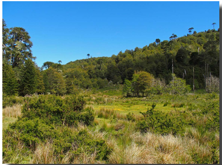
Figure 21. Lush but cold lower site in Parque Nacional Nahuelbuta.

Goniini: Chaetocraniopsis cf. chilensis Townsend [3 males]