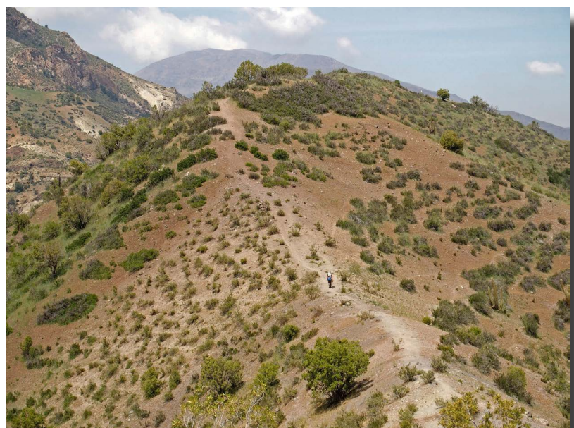
Figure 10. Pierfilippo on path to hilltop at Mirador de Los Tres Valles.