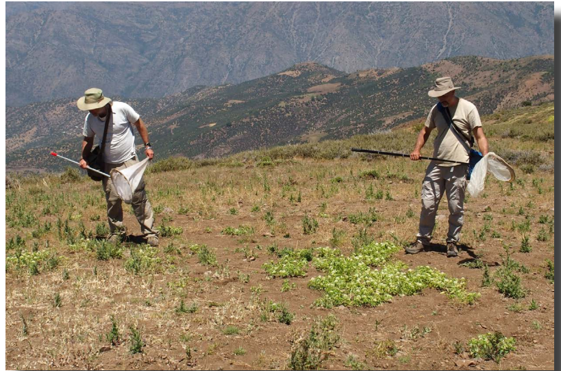
Figure 7. We returned on Dec. 19 to the place on the road to the Lagunillas ski area first visited on Dec. 8. A variety of tachinids were attracted to a few patches of a ground-hugging flowering plant being watched here by John and Pierfilippo.

Tachinini: Ruiziella ?luctuosa Cortés [2 males]