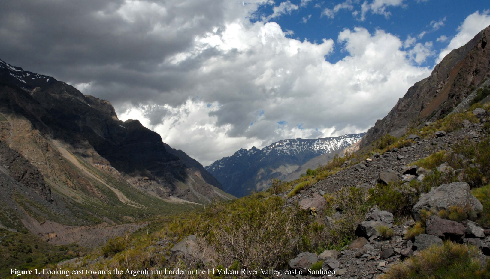
Figure 1. Looking east towards the Argentinian border in the El Volcán River Valley, east of Santiago.