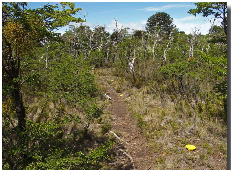
Figure 20. Yellow pan traps were surprisingly effective at attracting tachinids along the trail to Cerro Anay.