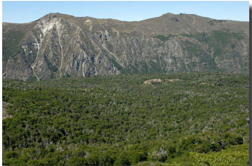
Figure 13. Nothofagus forest in the Shangri-La Valley east of Chillán.

Tachinini: Deopalpus ? pulchriceps (Aldrich) [1 male]