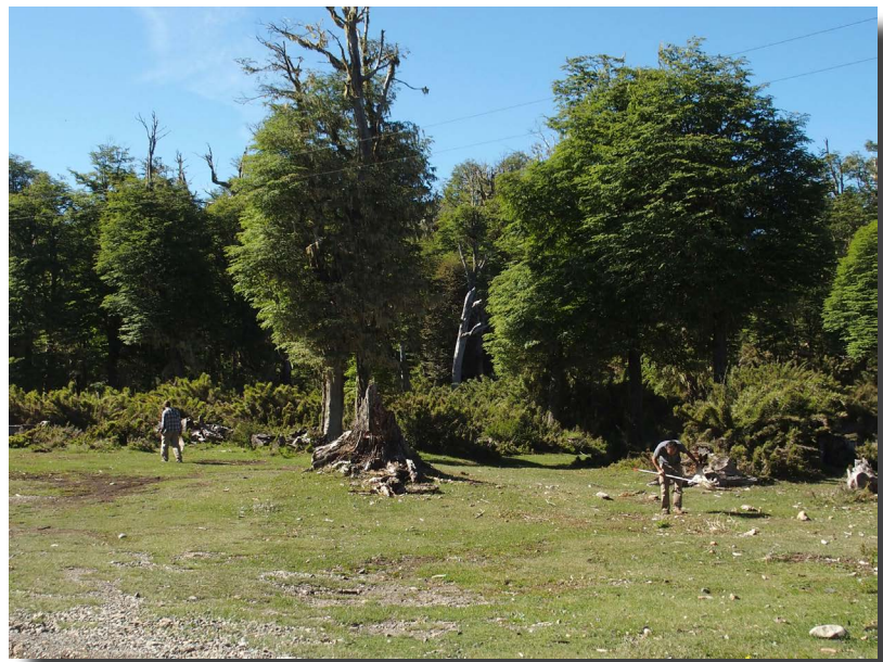
Figure 27. John and Diego search for ground-resting tachinids at the pass west of Laguna Iclama.

Megaprosopini: Trichoprosopus sp. 2 [2 males, 1 female]