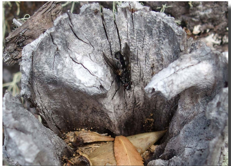
Figure 22. Dasyuromyia nervosa (Walker), a species not collected by John, perches in the hollowed-out base of a dead shrub at the lower site.