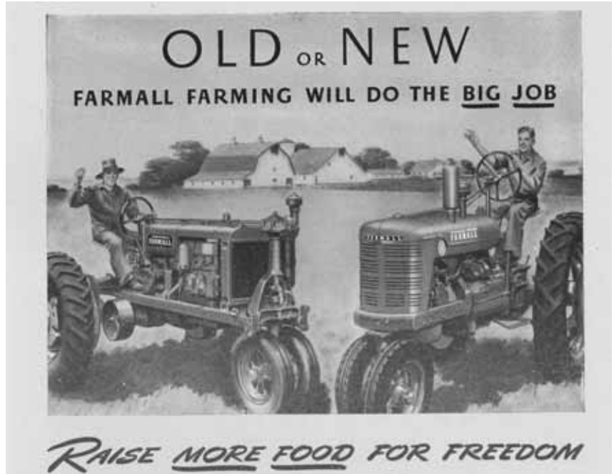
This ad for farm equipment had a wartime message.

A Publication of the OAC Alumni Association www.oac.uoguelph.ca/alumni | Fall 2012