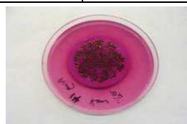
E.coli (Raw Manure)