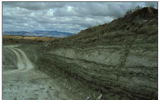
Ekirombe ky'e Mijingu e Tanzania.