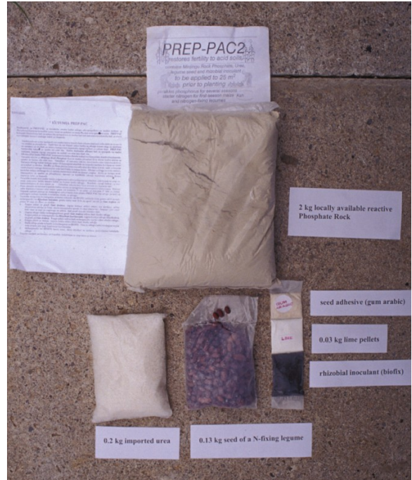
Ebibeera mu PREP-PAC