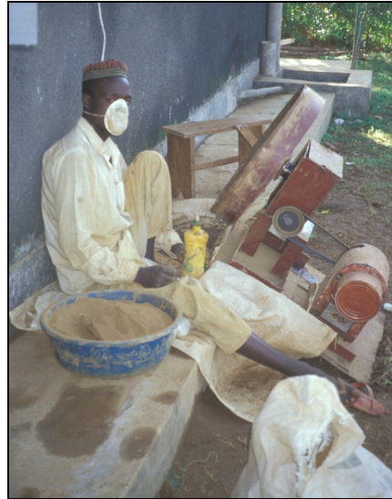
Pelletizer ng'akozesebwa okulongoosa Busumbu PR mu Uganda.

Kino ekigimusa obutafanana ko na kye sedimentary fosifeti ekimerenguka mangu mu mazi ng'okittadde mu ttaka era kikola bulungi ng'okikozeseza buterevu mu ttaka. Ekyokulabirako Busumbu PR ekisangibwa mu buva njuba bw'e Uganda tekimerenguka mangu kisana okw'ongera okulongoosa mu ng'obadde okikozeseza oryoke kigase ebimera. Abanonyereza n'abalimi bangi begezeseza enkola y'ekigimusa kino ekya igneous PR nokutambula ku mutindo gwa kyo nga bakitabika n'ebigimusa ebirala ebiva mu makoola agavunze, okukitabika n'obugimu obuva mu busa bw'ente.