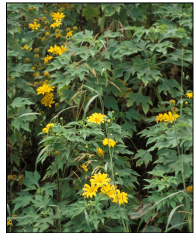
Tithonia diversifolia , ekiyitibwa Mexican sunflower kimera ku mabbali genguudo era kirina ebiriisa bingi.

Nga bwetwayogedde emabegako, PR akozesebwa buteerevu. Ate ku ludda olulala, ebigimusa bya PR ebirala byetaaga okukyusibya mungeri endala okwongerera ku nkola yabyo. Kino kiyinza okwetaaga okugezeza oba okukozeza ebikozesebwa byettaka ebirala nga obuzimu bw'ebikoola ebibisi nga Mexican sunflower, era nga byetaaga abakozi bangi. Abamu era bemulugunya olw'okulwawo okukola kwa PR era ng'alina okwetabula kwa mpola.