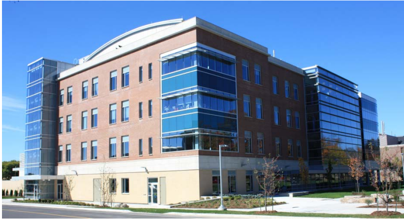
Combined Pathobiology - Animal Health Laboratory building (building 89) Federal-provincial funding—$32M federal, $25M provincial Completed move-in in November, 2010