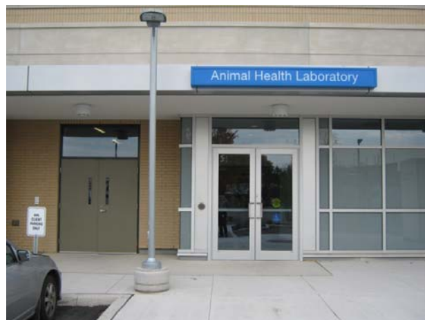
Specimen Reception on the west side of the building