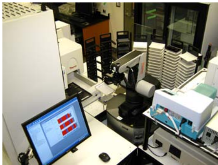
ELISA robot - capacity of ~1,500 tests per shift