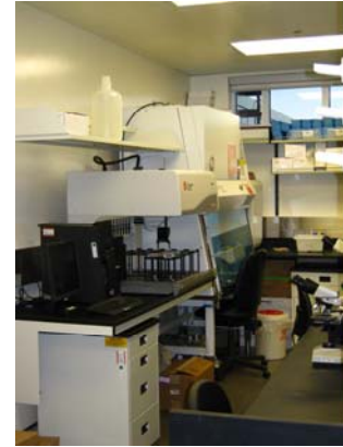
Nucleic acid extraction robot in foreign animal disease lab