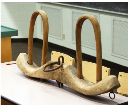
19th-century Oxen Yoke