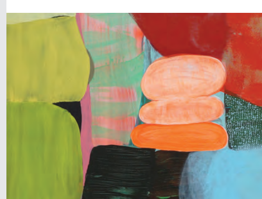
Rachel Crummey works in painting, drawing, and collage. She improvises with patterns and simple motifs, both building up structures and taking them apart. Recently she has begun incorporating text as a way to interrupt an otherwise formal vocabulary. rachelcrummey.com