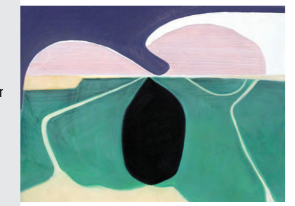
Maegan Harbridge paints to explore the possibilities of imagined spaces. When the painted space - a refuge for contemplation and a playground for the imagination - presses against the boundaries of a formal modernist aesthetic, its soft lines slip between abstract and representational forms. maeganharbridge.com