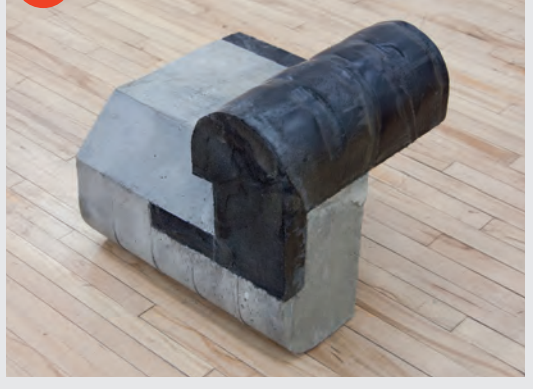
Jen Aitken makes sculptures and drawings using systems of limitations, aiming for sustained formal ambiguity and emphasizing material process. jenaitken.com