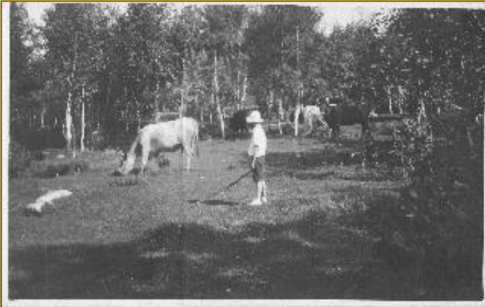
Chadwick's Farm