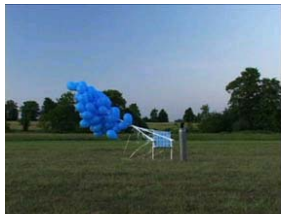
Laurel Woodcock conditions (video still)

Laurel Woodcock is curating an international selection of single channel videos for CAFKA 2007.