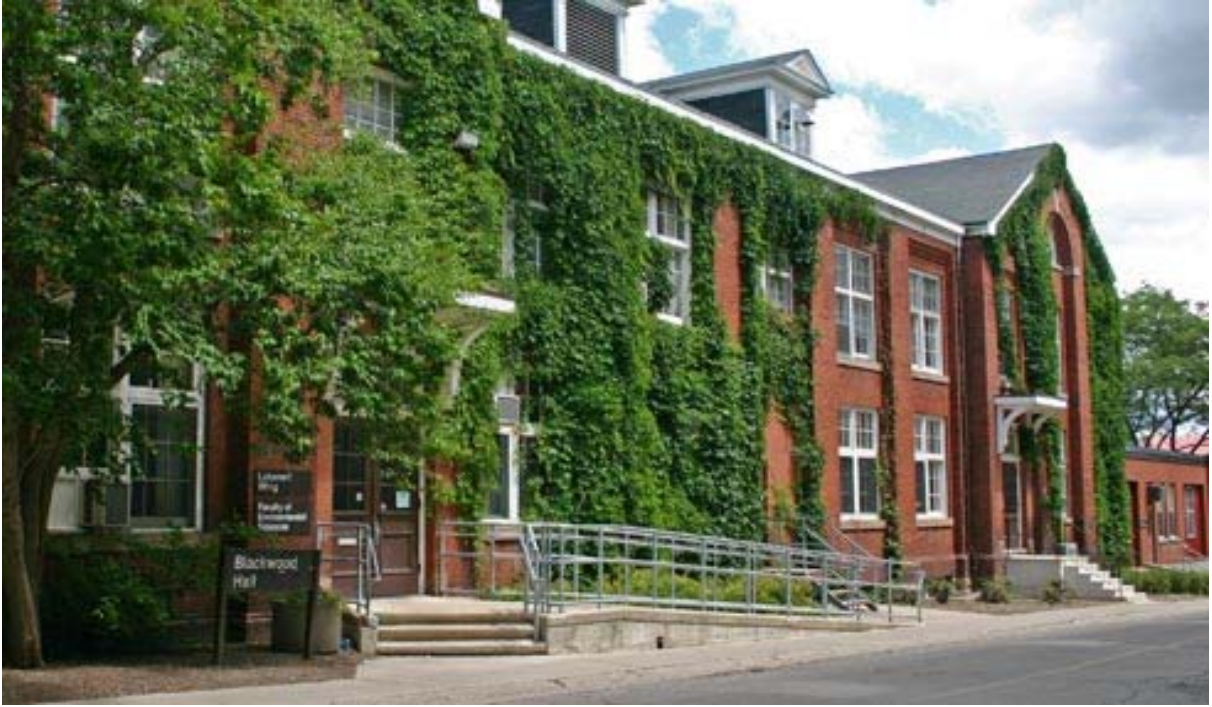
Blackwood and Firehall Studio Buildings