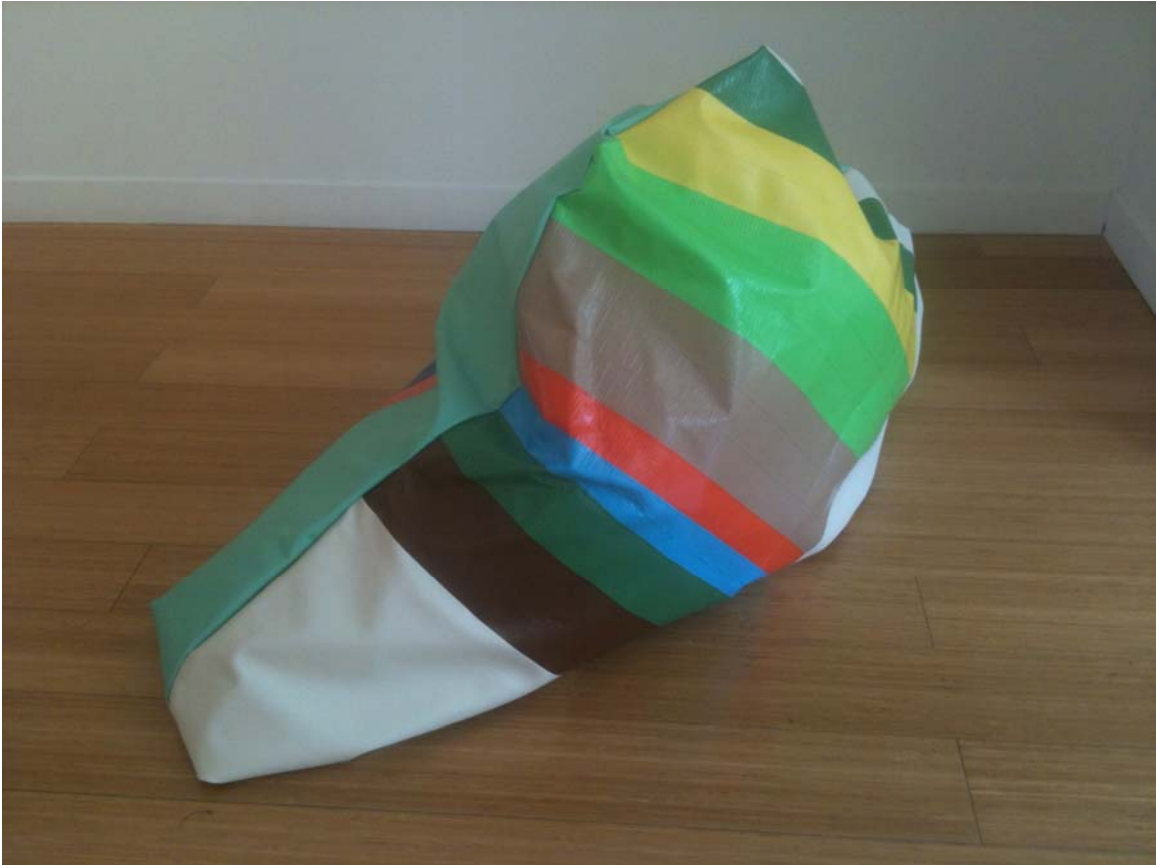
Detour , 2014, upholstery vinyl, foam and duct tape, 24" x 12" x 36" approx.