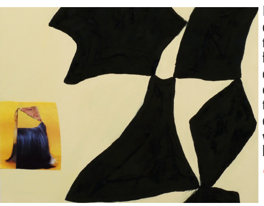
Brennan Kelly implements collage and assemblage strategies to explore the interconnectivity of materials culled from the expansive stream of commodity detritus. Through procedural and chance operations he seeks to obscure the intended functionality of these amalaamated materials, resulting in works that are positioned ambiguously between order and disorder. brennankelly.ca