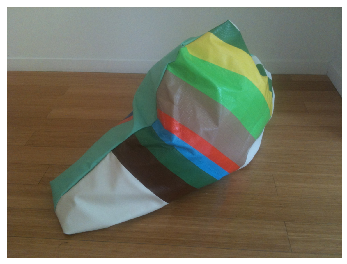
Detour, 2014, upholstery vinyl, foam and duct tape, 24" x 12" x 36" approx.