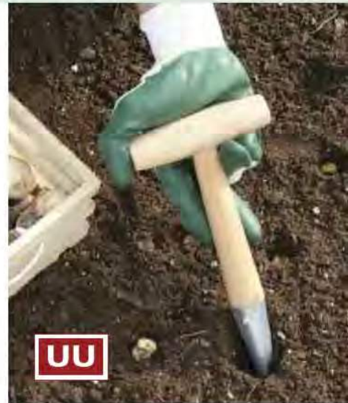
SS 3 NYLON TOOLS $10

The proper tool always makes gardening so much easier. Having reviewed and tested literally hundreds of hand tools over the years, we have determined that these three specific tools will simplify your efforts and make your results more rewarding. Moulded in Nylon (so much stronger than plastic), we have chosen today's three most popular colours for this set of Trowel, Fork & Cultivator. Each tool is designed so it can be hung and features an inlaid cushioned thumb rest to avoid blisters and fatigue.