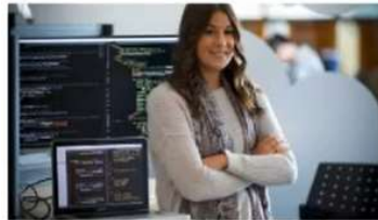
Bachelor of Computing