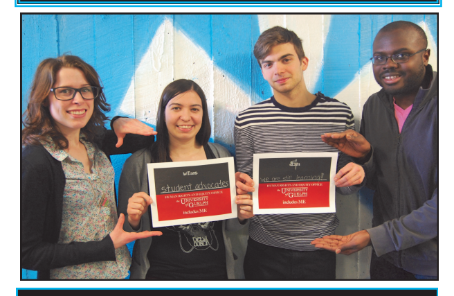
Office of Diversity & Human Rights @ University of Guelph

Inclusion Academic Freedom Human Dignity Impartiality Fairness Confidentiality Access Diversity Equity