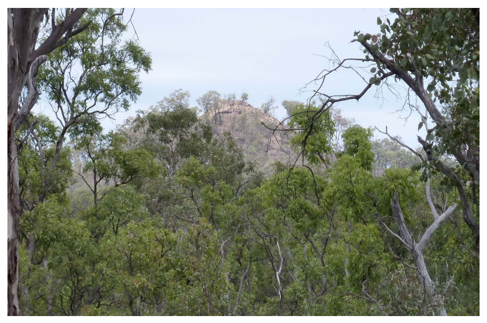
Figure 16 . The summit of Fly Hill in the Mt. Moffatt Section of Carnarvon National Park is barely 100 metres above the surrounding forest but is a mecca for hilltopping tachinids (and tachinidologists).

The second day was supposed to be an ascent of the more formidable Mt. Moffatt, but a completely overcast sky and periodic light rain forced a change in plans. We visited The Tombs area instead and hiked the loop trail, nets in hand, but caught little. That evening we drove to a place where a small stream crosses the road and tried blacklighting, but again with little success.