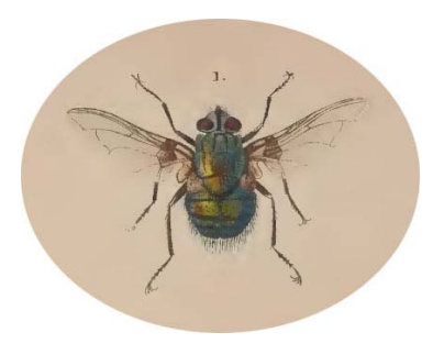
Figure 2. Rutilia regalis Guérin-Méneville, one of the first tachinids described from Australia (from Guérin-Méneville 1831: pl. 21).