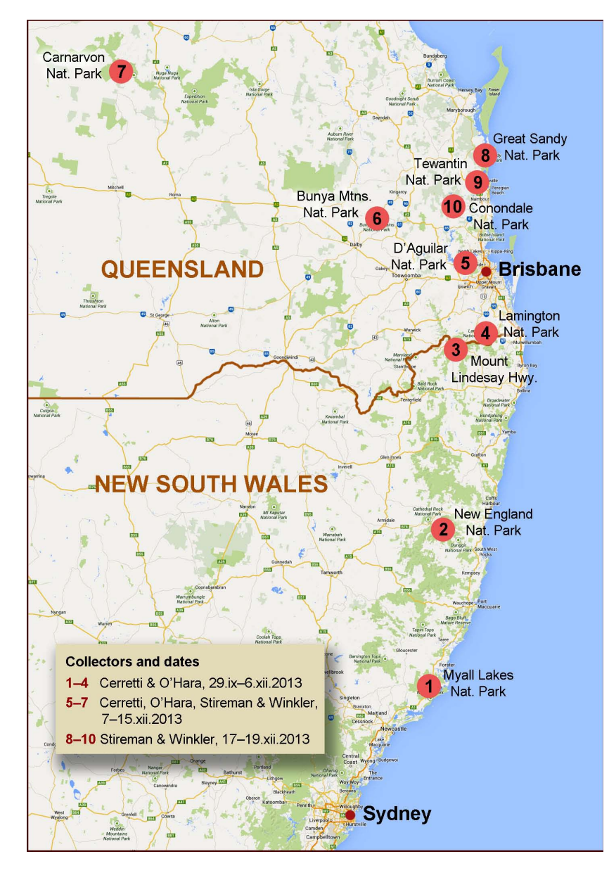
Figure 3. Map of major stops along our route during our collecting trip to eastern Australia.

and wet and dry rainforest. We collected along the coast at such places as Dark Point and Hawks Nest (both consisting of dunes), Robinsons Fire Trail (eucalypt forest), Mungo Brush Road (rainforest). At an inland site, we collected under The Grandis, a giant flooded gum tree thought to be the tallest tree in New South Wales (a remnant of old-growth forest). Of special interest, and a place to which we returned three times, was O'Sullivans Gap along Wootton Way (a.k.a. the Old Pacific Highway). In addition to tachinids, we sought and found the "McAlpine's fly" (Kutty et al. 2010), an enigmatic fly about 2 mm in length that strongly resembles a muscid except for robust legs and a stance in which the wings are held slightly apart (although not always) as do sev-