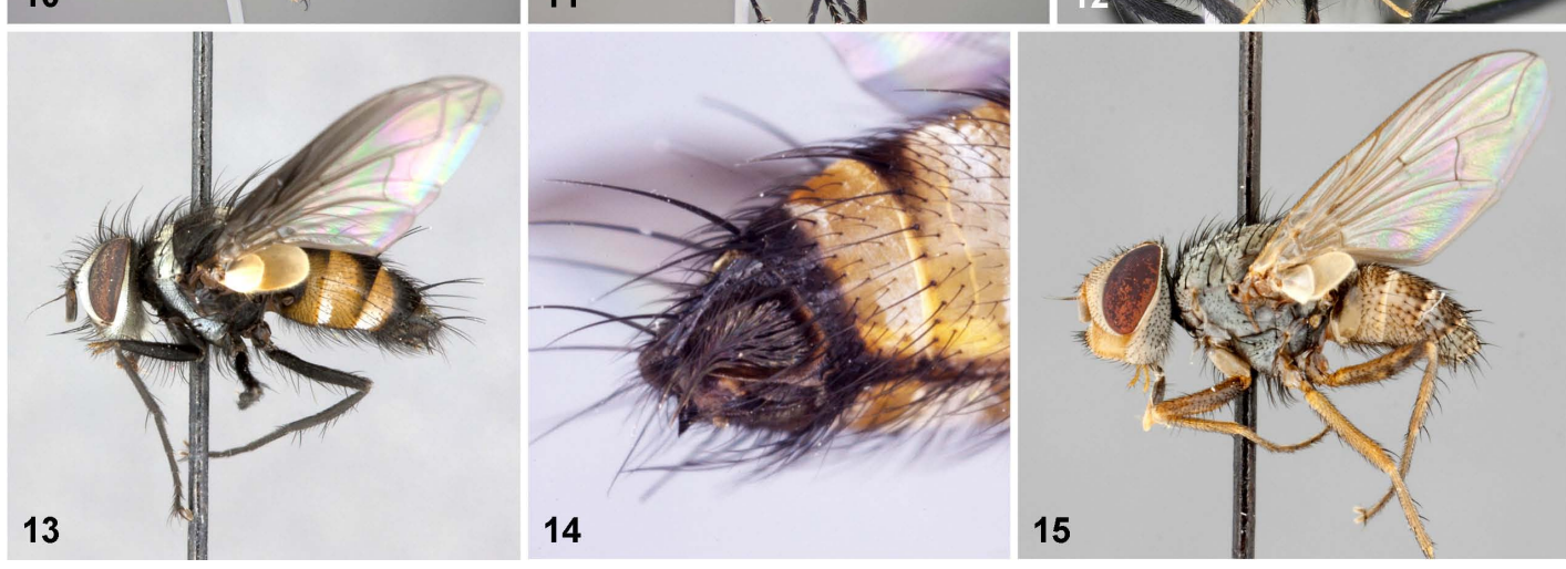
Figures 4–15. Some of the flies we collected in Australia. 4–6. Point Lookout, New England N.P. 4. Calliphora sp. (Calliphoridae). 5. Rutilia (Microrutilia) sp. (Tachinidae). 6. Senostoma sp. (Tachinidae) on tree trunk in typical, obliquely downward-facing, stance. 7. Zita sp. (Tachinidae), mimic of sarcophagid flies such as the one shown below it, Mt. Moffatt, Carnarvon N.P. 8–9 . Dexiine fly (Tachinidae), mimic of the calliphorid fly shown below it, Carnarvon Gorge, Carnarvon N.P. 8 . Lateral view. 9 . Anterior view of head. 10 . Sarcophagid fly (Sarcophagidae), Mt. Moffatt, Carnarvon N.P. 11–12 . Amenia sp. (Calliphoridae), Mt. Allan, Conondale N.P. 11 . Lateral view. 12 . Anterior view of head. 13–14 . Male of Zosteromeigenia sp. (Tachinidae), O'Sullivans Gap, Myall Lakes N.P. 13 . Lateral view. 14 . Tip of abdomen in ventrolateral view showing sexual patch within a concave area of tergum 5. 15 . Eustacomyia sp. (Tachinidae), Fly Hill, Mt. Moffatt Section of Carnarvon N.P.