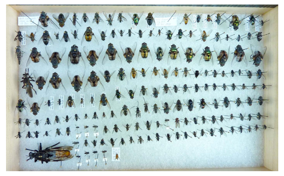
Figure 18. Specimens collected by Jim on 13 December 2013, consisting mostly of tachinids from Fly Hill.

Early the next day Pierfilippo and Jim left on their long drive back to Brisbane. They would spend the following day at the Queensland Museum and fly out from Brisbane and back to Italy and Canada the day after. Meanwhile, John and Isaac proceeded on to their next destination.