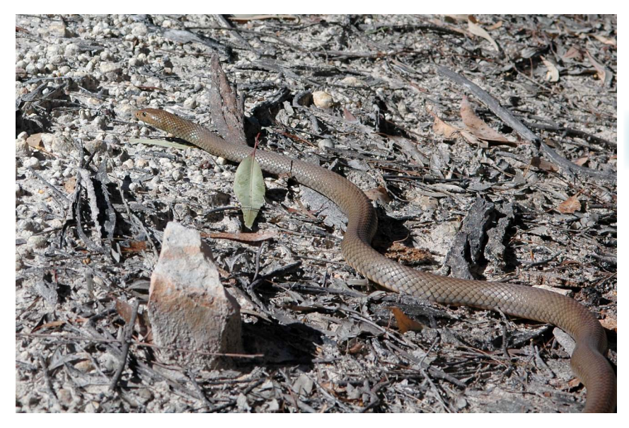
Figure 19. An eastern brown snake ( Pseudonaja textilis ) slithers to safety after being disturbed on the dirt road to the Consuelo Tableland in Carnarvon National Park. This is ranked as the world's second most venomous snake in some listings and is responsible for more snakebite deaths in Australia than any other snake.

After leaving Mt. Tinbeerwah, we traveled slightly inland to try collecting in Conondale National Park, a moderate-sized (35,500 ha) mountain park encompassing the Conondale Mountain Range, somewhat similar