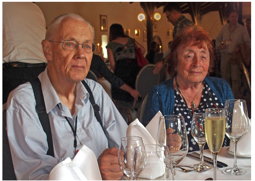
Figure 3 . The patriarch and matriarch of tachinidology, Monty Wood and Vera Richter, at the congress dinner during the 8th International Congress of Dipterology, Potsdam, Germany, on 13 August 2014.

3. Higher Brachycera. Science Herald, Budapest. 880 pp.