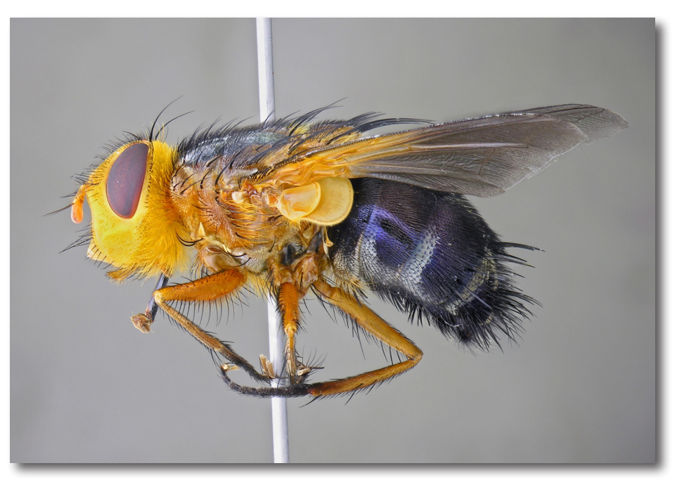
Figure 2 . Microtropesa sp., a strikingly beautiful member of the Tachinini from Australia. This genus was included in our molecular analysis.

The subfamily Tachininae has widely been considered a bit of a "junk group" where taxa that do not clearly belong elsewhere are often placed, although they do share the trait of ovolarvipary. There are no clear synapomorphies for the subfamily and it contains a diverse array of taxa, from tiny siphonines and graphogastrines (e.g., Phytomyptera ) to monstrous, spine-covered tachinines, and just about everything in-between. Therefore, it is a little surprising that the subfamily hangs together as well as it does in our analyses, minus the beetle-attacking Macquartiini and Myiophasiini, which do not seem to fit anywhere very well morphologically.