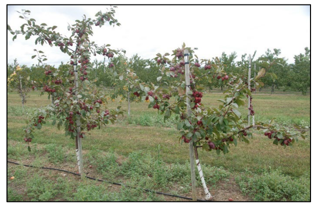
Fruit harvested from 'Providence' crab in September 2017