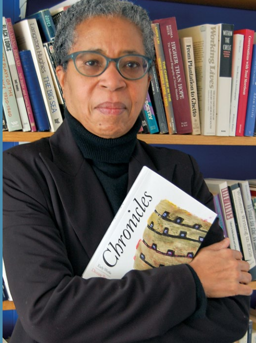
➤ DIONNE BRAND